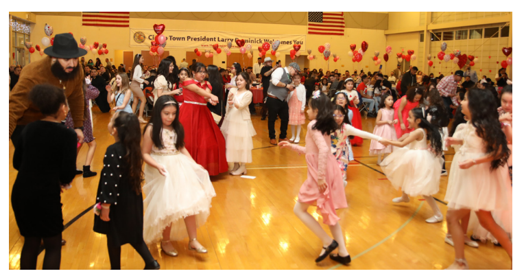
Daughters wore their some of their best dresses for the special evening with their fathers.