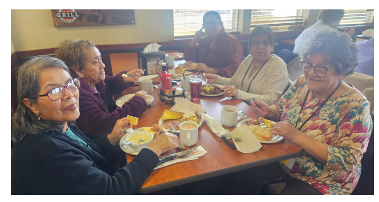
Other popular meals included lunch option soup, beans, toast, and more.