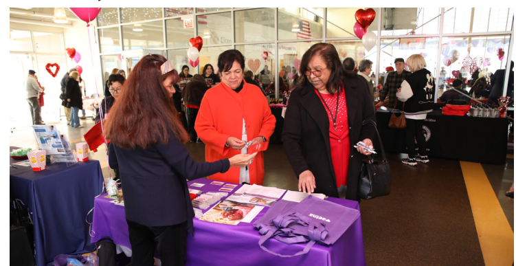
Organizations and departments were present to provide information about how they can support residents throughout the year.