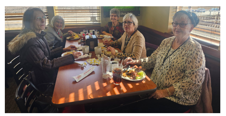
Residents enjoy a full brunch while catching up at Cicero's Golden Corral.

For those interested in future Senior Center activities, a simple step awaits: call the Cicero Senior Center at 708-222-8690 to sign up. Whether it's brunch, outings, or other engaging events, the center continues to create memorable moments for Cicero's seniors.