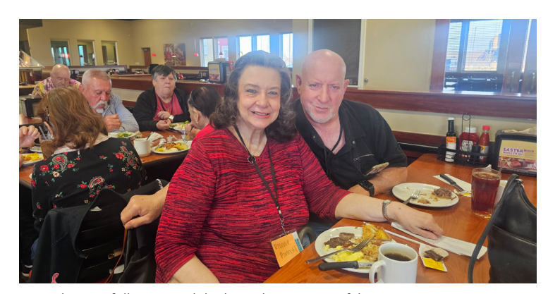
More than 50 folks enjoyed the brunch, courtesy of the Cicero Senior Center.