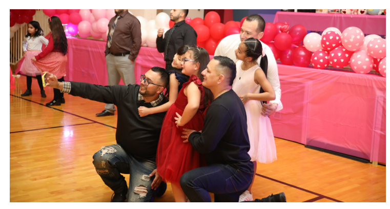
Dads get a selfie with their daughters during the annual Father/Daughter Dance.

The gymnasium, adorned with heart-themed decorations, became a dance floor where fathers twirled their daughters, creating memories that would last a lifetime. As the music played and laughter echoed, the Cicero Father-Daughter Dance epitomized the magic of love and family bonds.