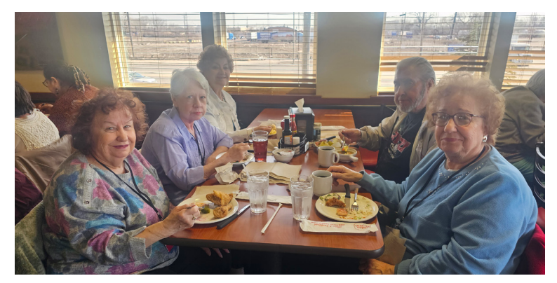
Some of the more popular dishes included warm breakfast options, such as French toast, bacon and eggs, and sausage.