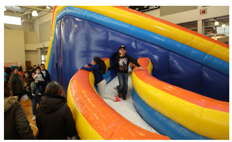
Cicero children play on the bounce houses while parents look on at the Easter in the Park event.