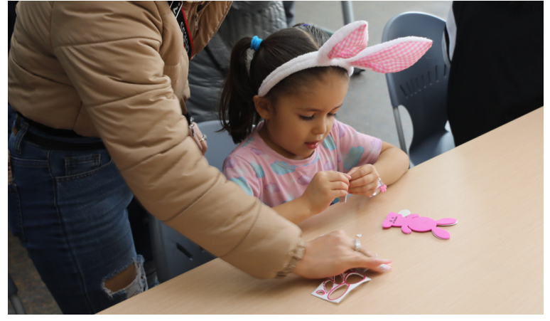
One child works on creating an Easter craft during the Easter in the Park celebration, which shifted indoors to keep out of bad weather.