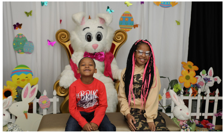
Children had a chance to take a picture with the Easter Bunny, an annual tradition for thousands of Cicero families.