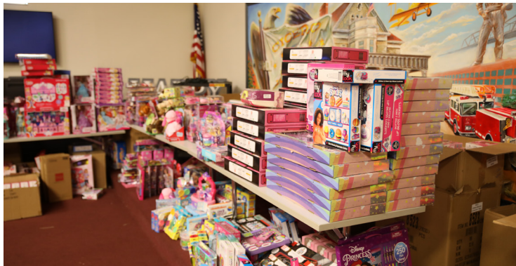
Gifts overflow for families to build their baskets for Christmas.

Gifts included toys for children of families in need and food and gift baskets for each family registered with the Town of Cicero.