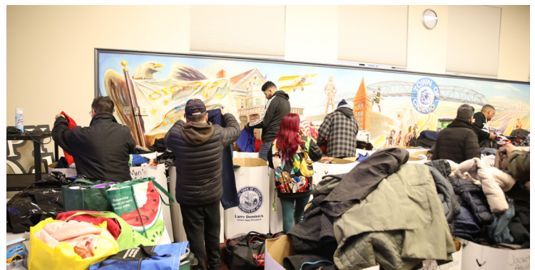
Families go through looking for clothes that fit and other provisions they need after the December 1 fire.