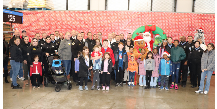
Cicero's Police Officers are joined by the families who participated in this year's "Shop with a Cop" event at Walmart.