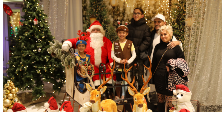
Families posed with Santa at La Posada on December 16.

It is a popular celebration in many Latin American nations, including Mexico, Honduras and Guatemala that has grown in popularity among many communities in the United States. As part of the Cicero tradition, people enjoy treats such as pan dulce and children get to take home an early Christmas present, courtesy of the town and the committee.