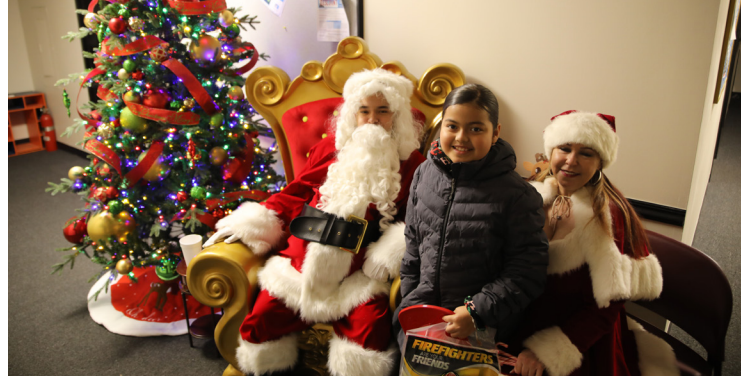
Families were able to visit Santa during the Christmas Gift Basket event on December 16.