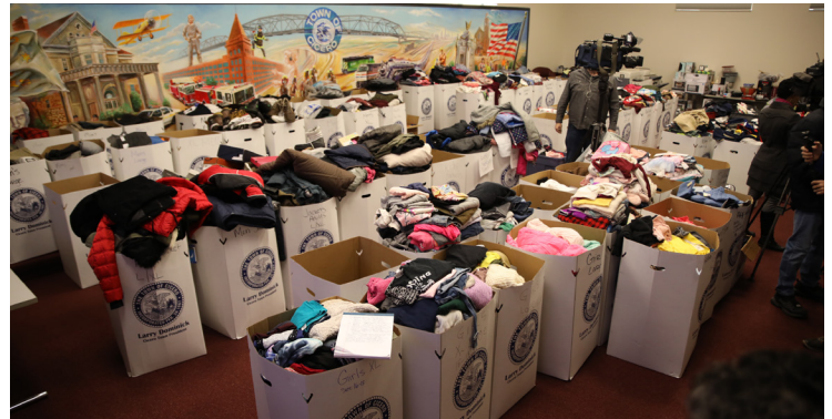
Boxes were overflowing with donations from residents to provide basic needs for victims of the December 1 fire.

"Christmas is around the corner, and to be able to put everything together and to come together has been a blessing," Vargas said.