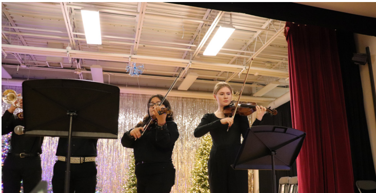
Musicians from Morton High School 201 joined in the fun.