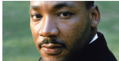
MLK Day African-American Culture