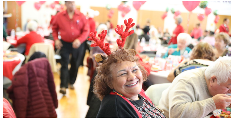
It was all smiles and fun at the Cicero Community Center.