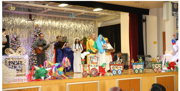
Mary and Joseph arrive at La Posada at the Cicero Community Center, celebrating the upcoming Christmas holiday.