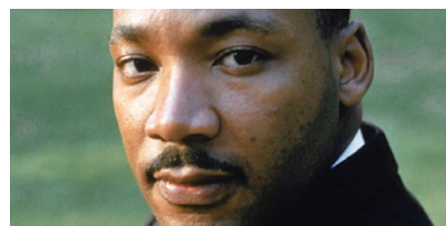
Día de Martin Luther King Cultura Afroamericana