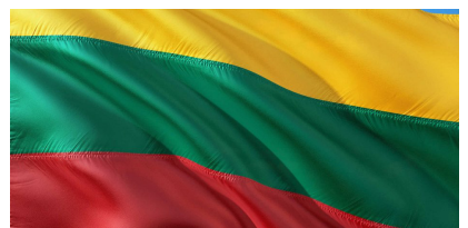
Día de la Independencia de Lituania