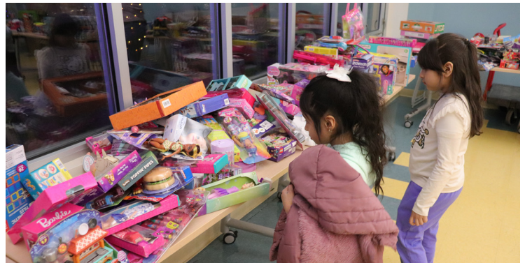
Children peruse the many toys available to take home as part of the celebration.