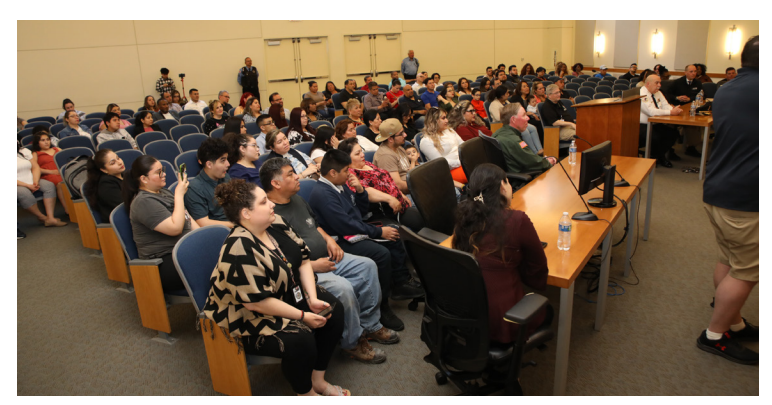
The CERT volunteers await their certificates of completion as the inaugural group of volunteers to complete the program.

Dominick announced plans for future CERT classes, emphasizing the ongoing commitment to community preparedness.